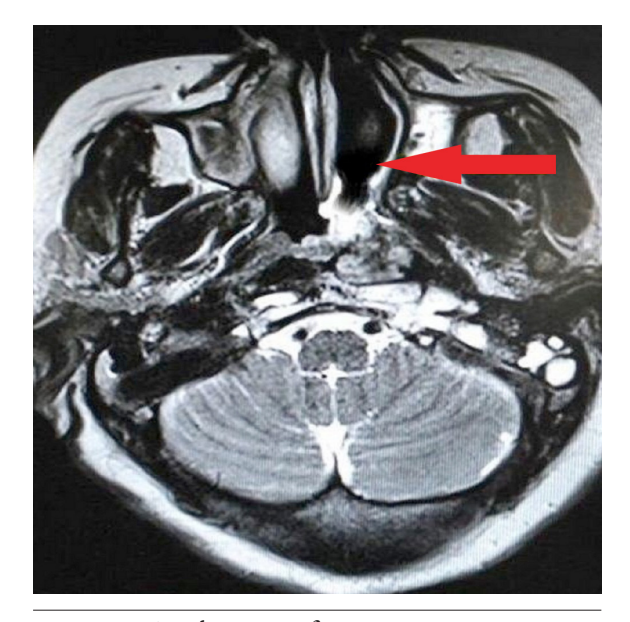
Figure 3: Axial section of magnetic resonance imaging post-adjuvant radiotherapy showing a significant radiological response.

et al,<sup>7</sup> reported two cases of ESMC involving nasal cavity and sphenoid sinus. In both cases curative surgery was not possible and adjuvant radiotherapy was given. Ganguly and Mukherjee<sup>1</sup> reported a case of maxillofacial ESMC managed with surgery and radiotherapy with DFS of one year while Zaki et al,<sup>8</sup> reported one case of ESMC of neck treated with chemoradiation. Following an extensive literature search, we could find only one case of nasopharyngeal ESMC reported in 2011 by Bhalla and Osipov.<sup>3</sup> Here, we present the second case of ESMC of nasopharynx reported to date.