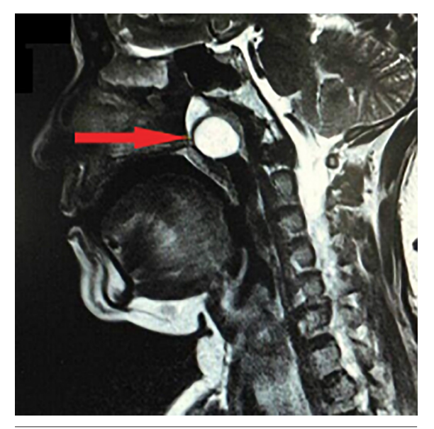
Figure 1: Sagittal section of T2-weighted magnetic resonance imaging showing well-defined hyperintense expansile soft tissue lesion arising from the nasopharynx, invading sphenoid and clivus (red arrow).

was treated with adjuvant conformal radiotherapy to a dose of 66 Gray (Gy) in 33 fractions to which she showed excellent symptomatic and radiological